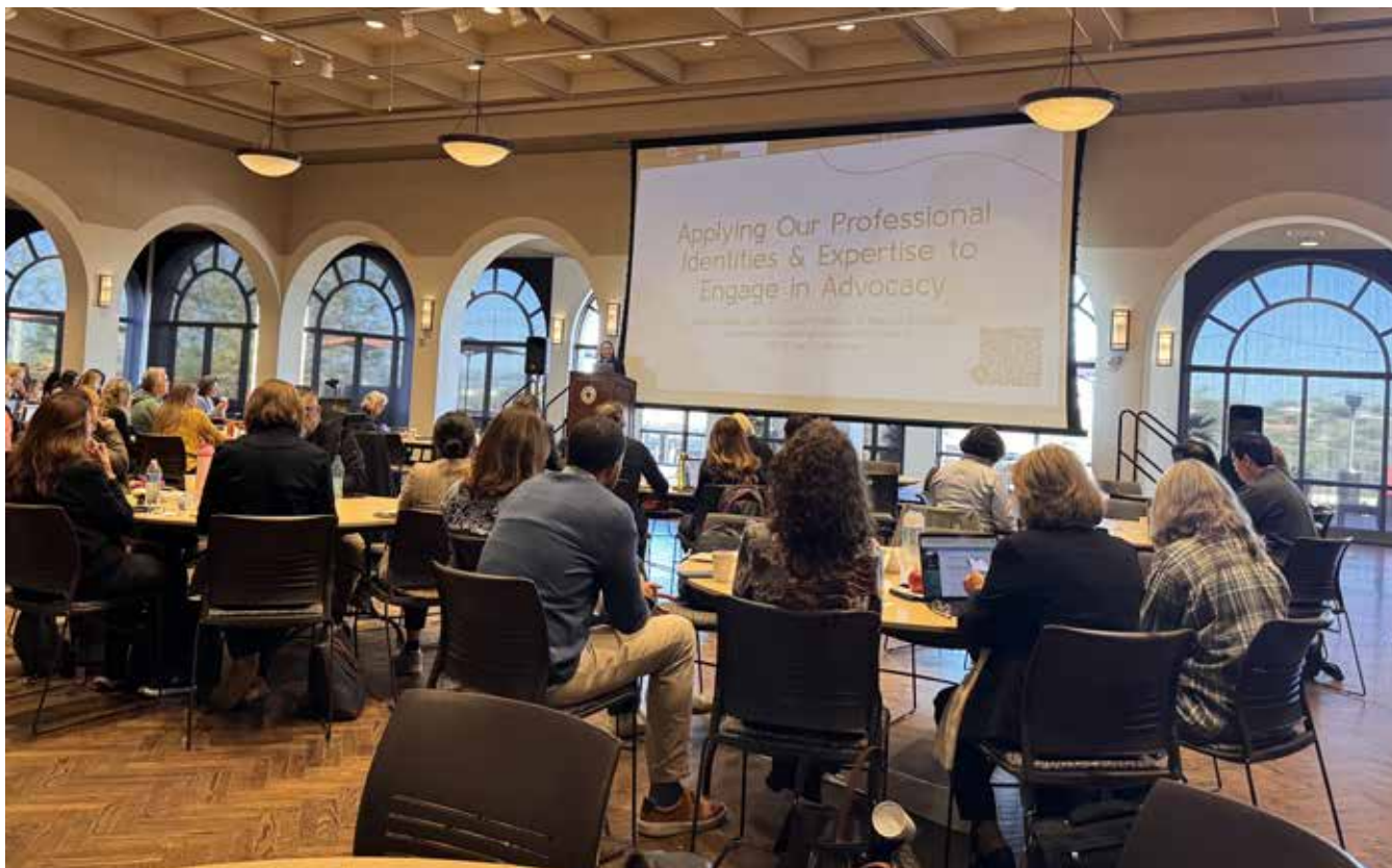
During the Friday morning working session at the CCTE Fall 2025 Conference.