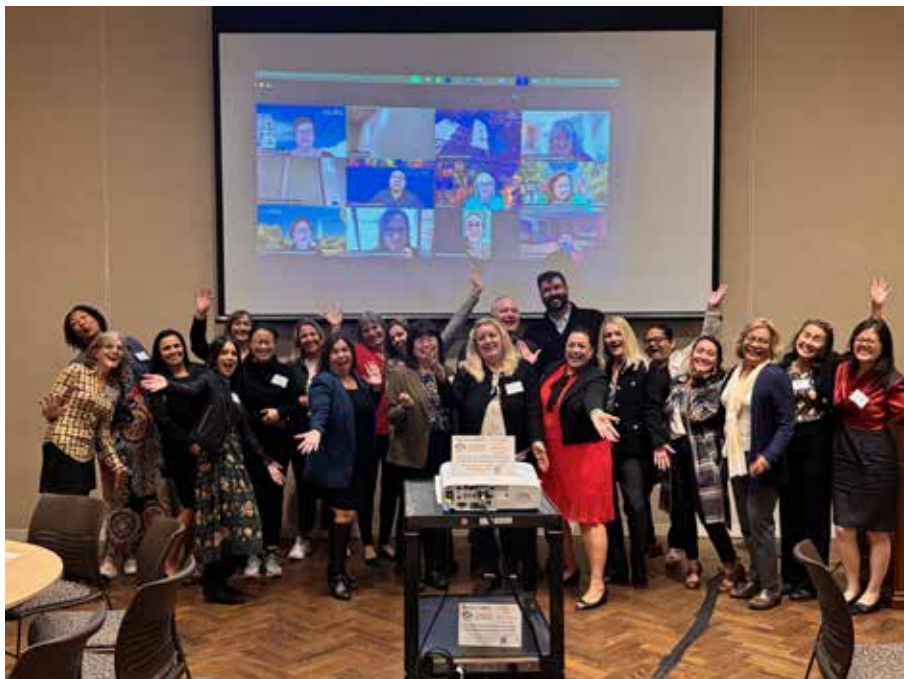
Participants in the California Association for Bilingual Teacher Education Meeting.