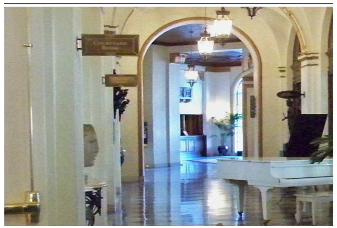
Sainte Claire Hotel, San Jose, main hall off lobby outside Ballroom, site of CCTE Spring 2011 Conference.